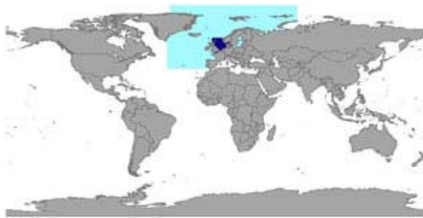
FAO Fishing Statistical Areas 27.3.a Skagerrak and Kattegat (Division IIIa) 27.4 Subarea 27.4 - North Sea (Subarea IV) 27.7.d 0 Eastern English Channel (Division VIIId)

The purpose of this tool is to highlight on a map the distribution area of a marine resource, based on the list of areas used to represent its distribution. In addition, FAO major fishing areas intersecting these areas can be used in the mapping process, e.g. to define the default zooming extent. This intersection is calculated using a relational table which provides the list of FAO major fishing areas for any area referenced in the RTMS.